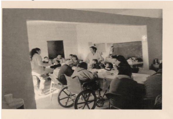
Kids in Sunday School, sharing snacks